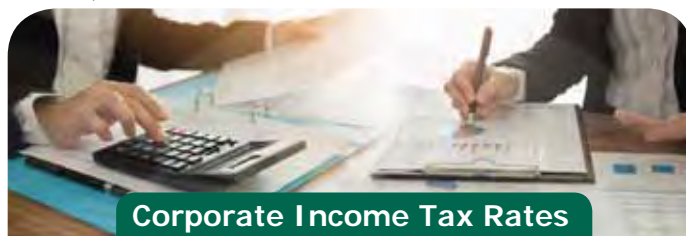
Corporate Income Tax Rates

Limited liability companies (LLCs) and limited liability partnerships (LLPs) generally offer limited liability and flow-through taxation. They have a flexible structure, which allows any entity, including a corporation, to be an owner. Special allocations of income and losses, as well as investments in other entities, are not limited.